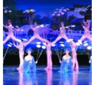
Community concert series