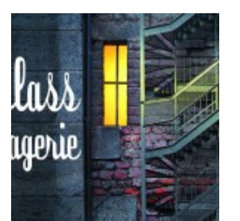
'The Glass Menagerie' opens