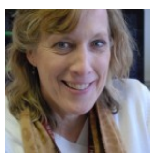
AMSA volunteer activity